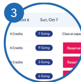
Reserve a Class or use a Day Pass instead!