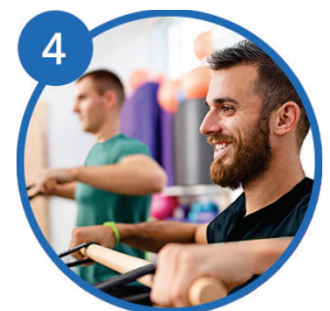
Show Up & Work Out

Visit fitonhealth.com/members for more info, or fitonhealth.com/help for questions.